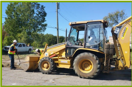
Access for All Students working onsite at the Bailey Street Clean Up Project