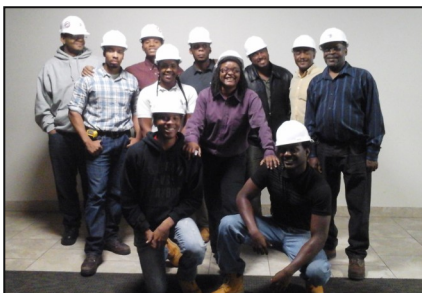
Cohort #3 Graduating Class 2015